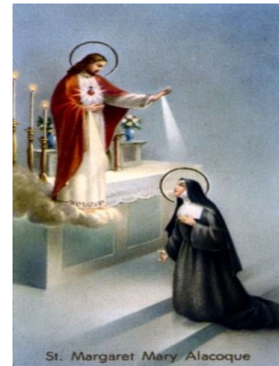
St. Margaret Mary Alacoque Monday, October 16, 2023

October 15, 2023 28th Sunday in Ordinary Time