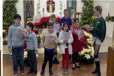
Children's Mass 2023