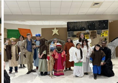
Children's Nativity Play