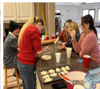
Parents Day Out