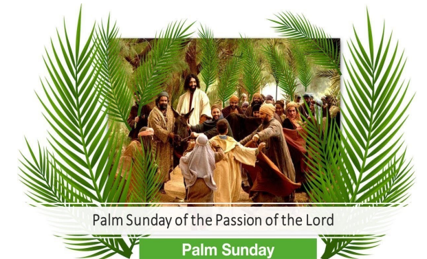
Palm Sunday of the Passion of the Lord