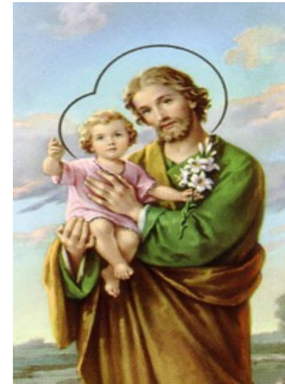
Saint Joseph the Worker