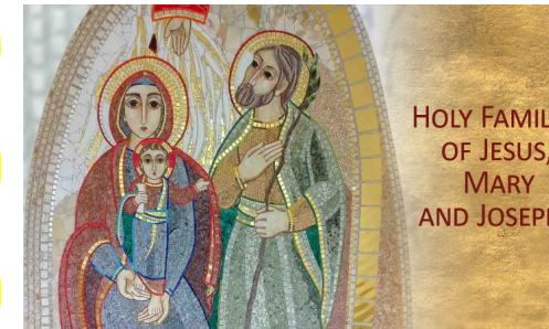
HOLY FAMILY OF JESUS, MARY AND JOSEPH